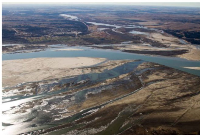
Figure 2. The key characteristics of a watershed that drive management approaches are the integration of land and water resources, the causal link between upstream land and water use and downstream impacts and externalities (e.g., serial externalities, the actions of the upland inhabitants affect the downstream inhabitants but the actions of downstream inhabitants cannot impact those upstream), and the multiplicity of stakeholders. This photo, taken 28 November 2011, shows the confluence of the Niobrara and Missouri rivers near Niobrara, Nebraska. The Niobrara River contributes 50% of the sediment entering Lewis and Clark Lake.

Technologies to restore abandoned cropland back to productive rangeland, driven by aquifer depletion, drought, and climate change. This issue was ranked initially in a seven-way tie as No. 20 by workshop participants but highly ranked for relevancy and difficulty by the water working group. Significant amounts of irrigated cropland in aquifer overdraft areas will revert to dryland in future years. Because of its large size and severity of overdraft, particularly in the southern portion and the recent southwestern US drought, the Ogallala Aquifer area is the focus of considerable attention and makes sense as a case study. After the Dust Bowl of the “Dirty ‘30s” and before World War II, land in the High Plains was primarily rangeland used for producing cattle with some