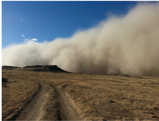
Figure 3. Dust storm in Cimarron County, Oklahoma, January 2013. Wind erosion from fallow crop fields and fields with failed winter wheat in southeastern Colorado are the source of the dust clouds. Stabilizing soil and restoring perennial vegetation in this and other areas of the West after aquifer depletion serve as major research and extension needs.