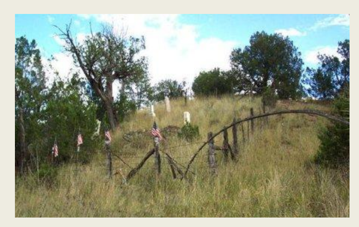
WS Ranch, Catron County, New Mexico