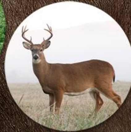
Wildlife and Fisheries