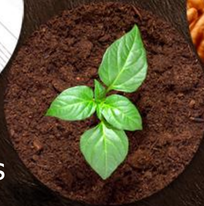
Soils and Crops