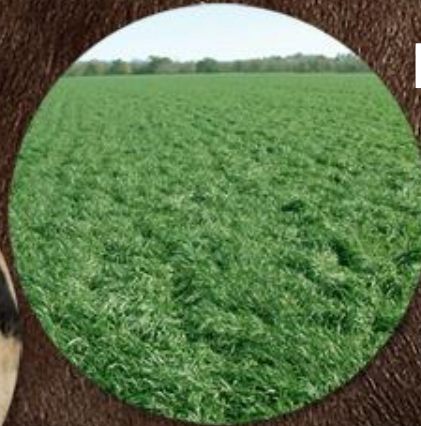
Pasture and Range